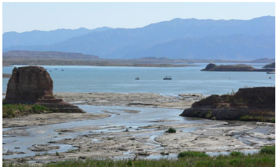
Treated wastewater from the Las Vegas Wash empties into Lake Mead, which is the primary drinking water source for the Las Vegas Valley.

For this project, the researchers will test a biotechnology that uses bacteria isolated from local soil, Bacillus mojavensis , to create biofilms that can degrade phenolic and aromatic compounds. “Phenols persist in the environment because aromatic rings are very stable,” Sun says. “Even bacteria cannot metabolize them until the rings are opened up and linearized, which can only be done through reaction with hydroxyl radicals. This is why these compounds are traditionally treated with ozone and UV irradiation.” B. mojavensis produces hydrogen peroxide, which generates