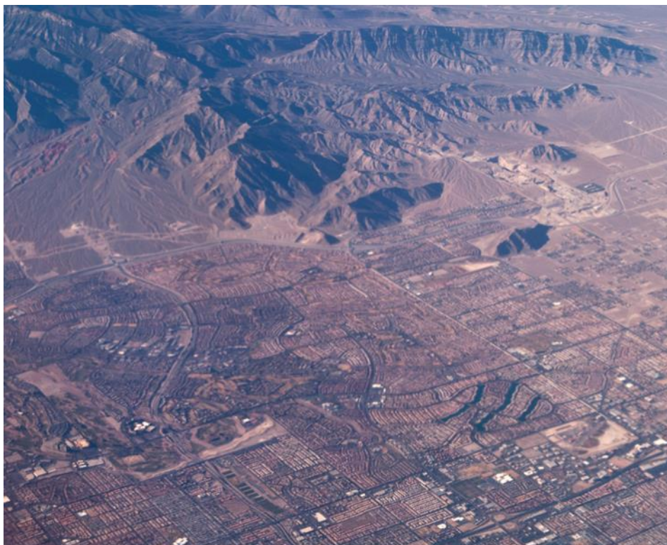
As populations in semiarid regions such as Nevada continue to grow, finding ways to preserve and extend limited water resources will become even more critical.

The researchers hypothesize that the biofilm will oxidize the target phenolic compounds and release carbon dioxide. This hypothesis is based on Sun's previous research on D-amino acids, or right-handed amino acids. "Amino acids come in two forms: left-handed or right-handed. All living organisms synthesize left-handed amino acids," he says. "D-amino acids are generated in the environment by racemization of left-handed amino acids, and they are toxic. Bacteria possess specific oxidases that catalyze their oxidative degradation, turning a toxic substance into a nutrient source. We believe such oxidative power in biofilms can be used to degrade phenols." To test their hypothesis, the researchers will assess the biofilm's ability to degrade