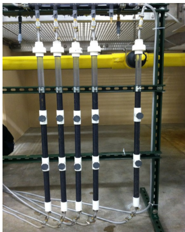
Biological activated carbon columns

As drought, climate change, and population growth make the availability of conventional water resources more uncertain, an increasing number of cities will turn to potable reuse to satisfy their water demands. In potable reuse applications, advanced treatment processes are used to convert wastewater to high-quality drinking water. Southern Nevada uses a variation of potable reuse because the water in Lake Mead is augmented by water from the Las Vegas Wash, which is primarily treated wastewater, and that water is then used as a drinking water source. Although the final water quality in potable reuse systems is often better than conventional alternatives and in some systems it is often on par with bottled water, these systems do pose challenges. For example, reverse osmosis filtration is plagued by high capital costs, operational costs, and energy consumption and it also produces a concentrated brine stream that must be discharged.