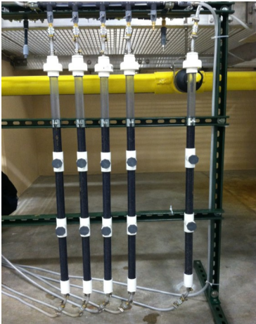
Biological activated carbon columns

As drought, climate change, and population growth make the availability of conventional water resources more uncertain, an increasing number of cities will turn to potable reuse to satisfy their water demands. In potable reuse applications, advanced treatment processes are used to convert wastewater to high-quality drinking water. Southern Nevada uses a variation of potable reuse because the water in Lake Mead is augmented by water from the Las Vegas Wash, which is primarily treated wastewater, and that water is then used as a drinking water source. Although the final water quality in potable reuse systems is often better than conventional alternatives and in some systems it is often on par with bottled water, these systems do pose challenges. For example, reverse osmosis filtration is plagued by high capital costs, operational costs, and energy consumption and it also produces a concentrated brine stream that must be discharged.