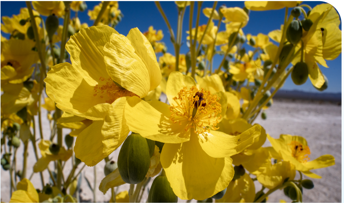
Las Vegas bearpoppy.

Success and dedication to quality research have established DHS at DRI as the Nevada Water Resources Research Institute (NWRRI) under the Water Resources Research Act of 1984 (as amended). The continuing goals of NWRRI are to develop the water sciences knowledge and expertise that support Nevada's water needs, encourage our nation to manage water more responsibly, and train students to become productive professionals. The work conducted through the NWRRI program is funded through the United States Geological Survey Water Resources Research 104(b) and 104(g) grants made available to each Water Resources Research Institute (USGS Grant/ Cooperative Agreement No. G21AP10578). DRI administratively houses and logistically supports the operations of NWRRI.