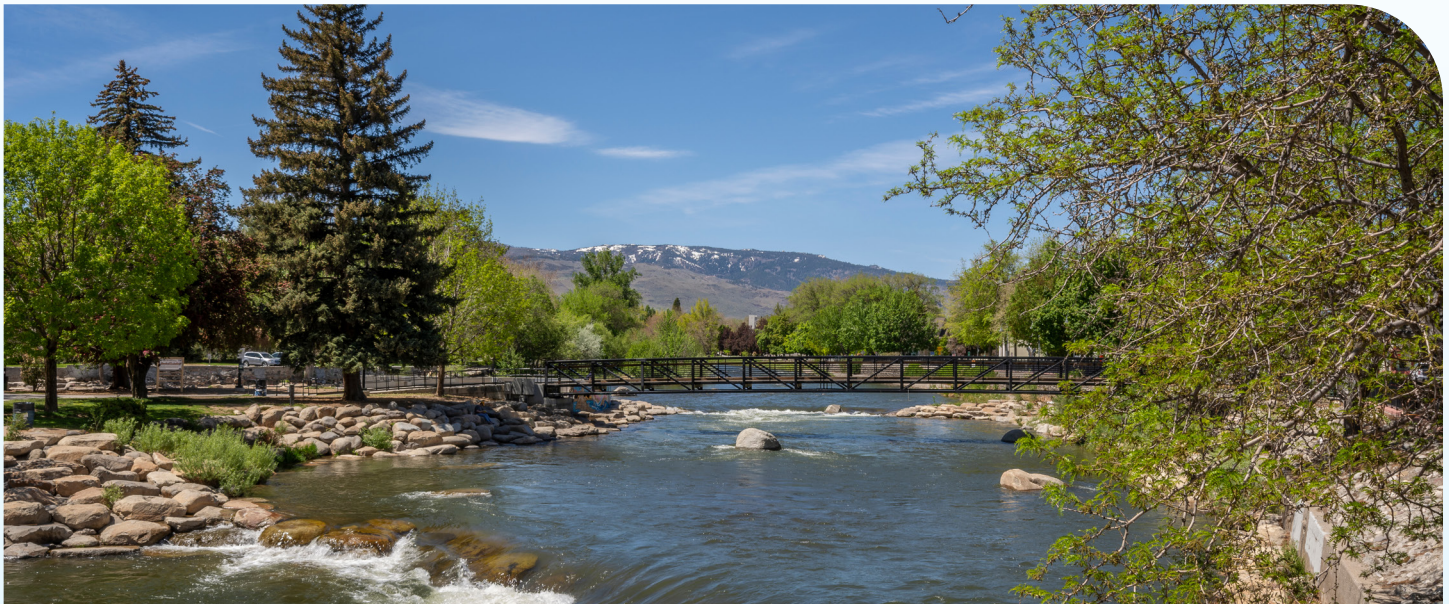
Bridge over the Truckee River in Reno, NV.

This project is funded through the United States Geological Survey Water Resources Research 104(b) grant made available to each Water Resources Research Institute.