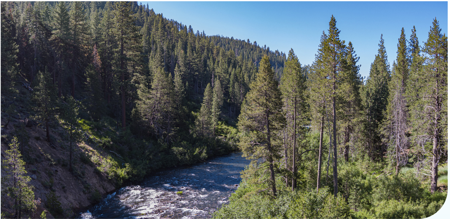
The Truckee River flows through forests in California and into Nevada.

“Data collection will include snow depth and density, snow melt dates, and physical soil properties such as density, texture, moisture, and temperature. We hope to learn how these forest treatments have altered snow accumulation and melt, water uptake by plants, and soil infiltration.”