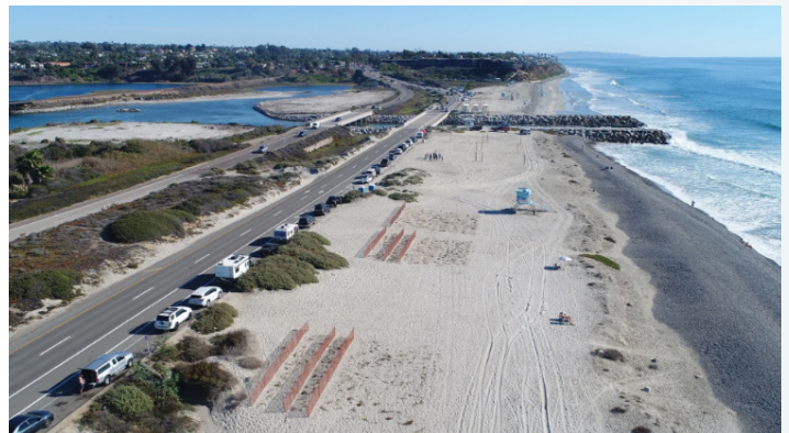
PONTO BEACH, CARLSBAD