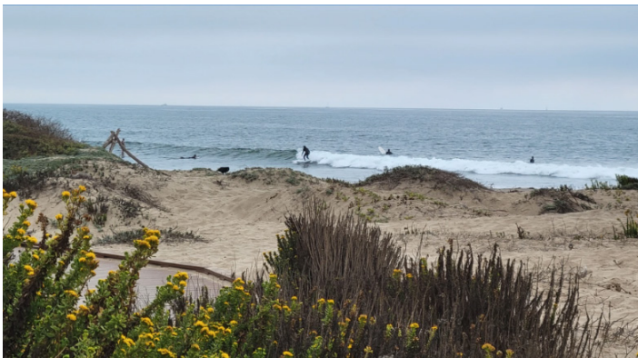
SURFER'S POINT, VENTURA