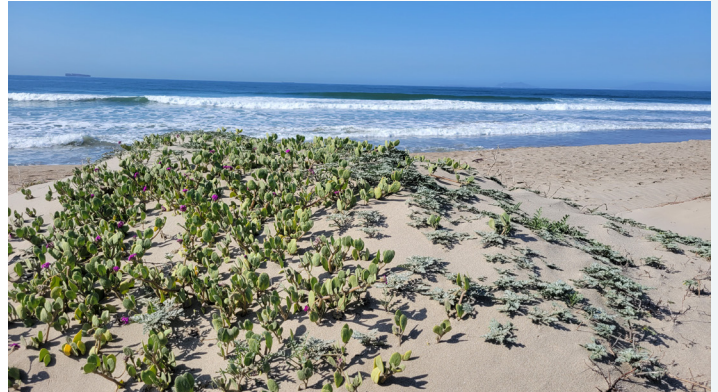
ORMOND BEACH DUNES & LAGOON