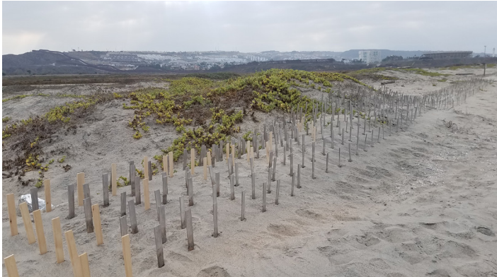
BORDER FIELD STATE PARK

Community Partners: Local and state coastal and beach managers from San Diego to Santa Barbara