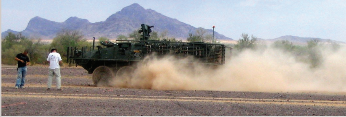
PHOTO CAPTIONS Bottom left & right: Research and development of technology in C-IED and countermine detection.