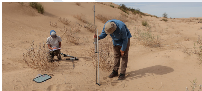
PHOTO CAPTIONS DRI scientists measure the potential for wind erosion and dust emissions from desert soils similar to those found in military zones in the Middle East and Southwest Asia.

The variable nature of terrain (topography, ground/vegetation cover, soil condition) will greatly impact the success of military operations, including operational mobility, weapon performance, communications, and counter IED/landmine. Because accurate terrain data in areas of strategic interest is commonly limited or inaccurate, DRI developed the Integrated Terrain Analysis Program (ITAP) to advance technology that provides prompt and accurate characterization of all terrain types and conditions using a combination of space- and airborne- information and science-expert analysis.