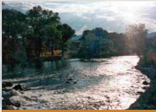
Mature cottonwoods hug the banks in the Truckee River’s lower basin. This unassuming waterway must support the ever-growing needs of northern Nevada communities, fisheries, agriculture, recreation and wildlife habitats.

Tracy explains that the reclamation bureau has to decide “way in advance” how much water to divert from the Truckee to maintain desired levels at Lahontan. “We want to give them a better tool, an effective